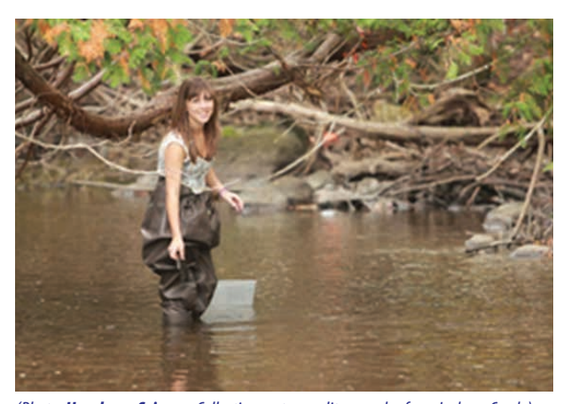
(Photo: Hands-on Science . Collecting water quality samples from Jackson Creek.)

Join the tradition of IB excellence. Apply to the IB Diploma Programme today. Apply Now: Deadline is Friday January 24, 2020